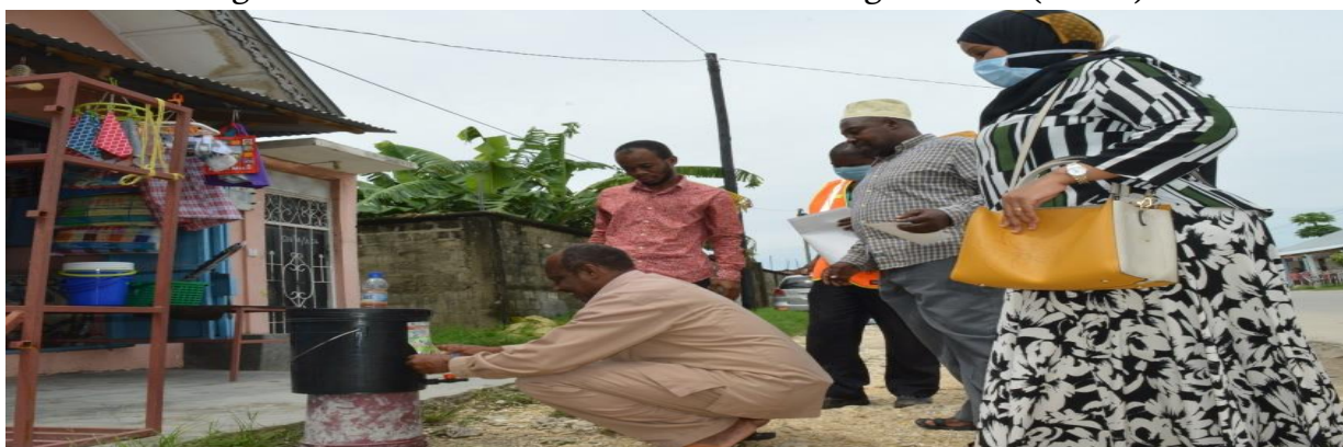
ANGOZA staff sticking posters on a bucket of water for customers to wash their hands before receiving services

Posters were also printed and disseminated with the view of sensitizing the public on appropriate measures of washing hands in accordance to World Health Organization (WHO) directive.