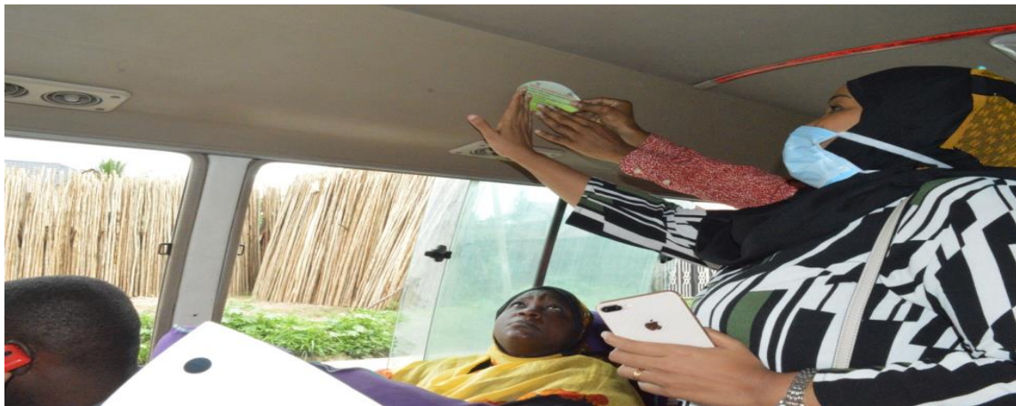
Staff distributing stickers in “Daladala” of Kisauni route to inform passengers on COVID 19

pandemic. They were disseminated to the public through social media while hard copies were distributed by ANGOZA staff in collaboration with a representative of NGO for Drivers and conductors. Hard copies of brochures were also distributed in the markets and shops. The brochures inform on COVID 19 symptoms and how to prevent people from getting COVID 19 disease. The stickers targeting passengers of public transport passengers were distributed in various routes in Unguja, as shown in below photo.